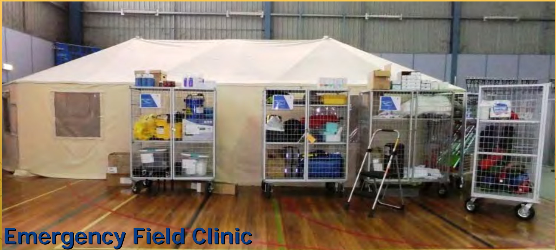
Emergency Field Clinic