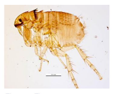
Figure 1 Flea

Fleas are small wingless external parasites from the Order Siphonaptera. Adult fleas range from 2 to 4mm in length, are brown in colour, and oval in shape. Their six legs are strong and spiny, with powerful hind legs for jumping. Relative to body size, fleas are one of the best jumpers of all animals and are able to jump over 200 times their body length.