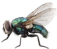
Figure 3 Blowfly

Aside from the noticeable 'buzzing' noise emitted by blowflies, the reason for their namesake is the attraction of female blowflies to exposed meat, including wounds of livestock. The female blowfly prefer to lay the eggs in these areas, thus the area being 'blown'. This poses a serious threat to human health as the spread of disease from meat sources can often be transferred onto other items that the blowflies frequent, for example, cooking utensils.