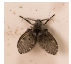
Figure 5 Moth Fly

The moth fly is between 2 and 4mm long, being dark grey in colour, with its body covered densely with fine hairs but the most obvious feature are the moth-like shaped wings and the hairy fringe on the wings.