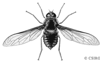
Figure 1 Order Diptera

Worldwide, there are over 150,000 species of flies, ranging from the tiny moth flies, that are true to their name with their moth-like appearance; to the larger blowflies and flesh flies, conspicuous in their appearance and activities. In Australia, there are over 7700 species of flies, dispersing across the nation due to favoured climatic conditions by different species.